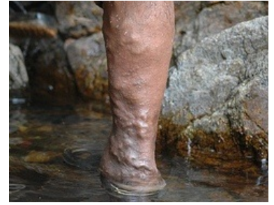
Varix on the right lower extremity

Venopharmaceutical refers to a heterogeneous group of medication used for the therapy of venous diseases, in particular, chronic venous insufficiency . The essence of the effect is increasing the tone of the venous wall , which leads to a decrease in the lumen of the affected veins and an acceleration of the outflow of blood (slow blood flow is one of the main mechanisms of Thrombosis). They also have a positive effect on microcirculation, where they reduce the permeability and fragility of capillaries and improve lymphatic drainage. What's more, they prevent the appearance of edema and improve tissue trophism. Some of them have a mild anti-inflammatory effect (tribenoside, calcium dobesilate). In some polycomponents are added dehydrated ergot alkaloids (DH-ergocristine) for their arteriolodilatation, venotonic and capillarotonic effect. The group of venodrugs also includes sclerosing agents .