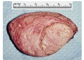
Cardiac rhabdomyoma in the right ventricle in a three-year-old girl externally presenting with a heart murmur.

See the Rhabdomyoma page for more detailed information.