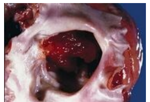
Cardiac myxoma: gelatinous tumor almost completely filling the left atrium.