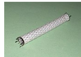
Grafted-stent (8 mm; used for lesions aa. iliaca)