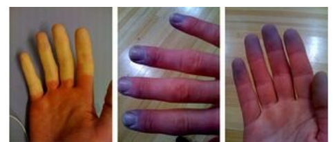
Color changes in fingers