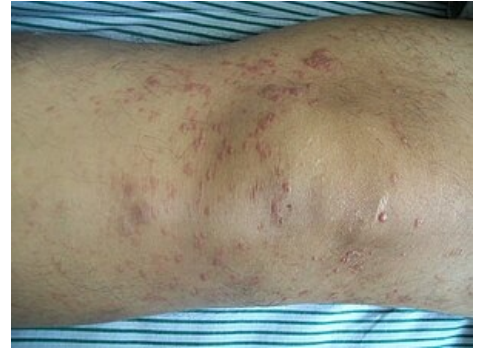
Mycosis fungoides knee