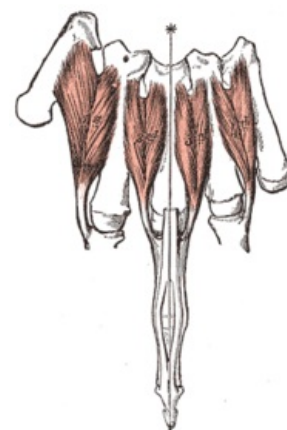
Musculi interossei dorsales