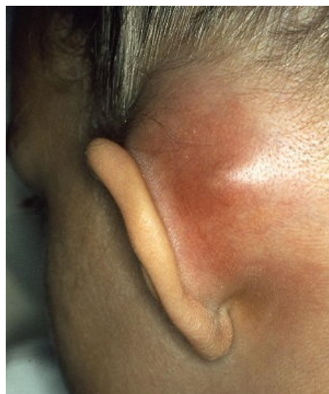
Subperiosteal abscess as a complication of mastoiditis