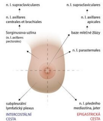
Breast quadrants and their drainage

Lymphatic connections between the two breasts have also been repeatedly demonstrated.