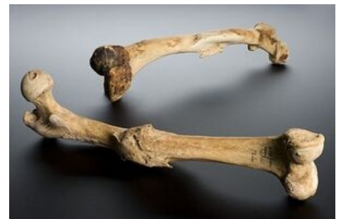
poorly healed fracture of the femur