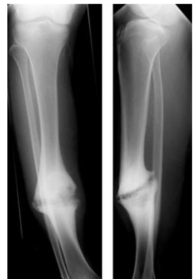
Hypertrophic tibial arch