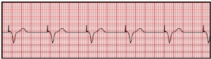
Fig 2. Shows that when skin a sources electrical signal