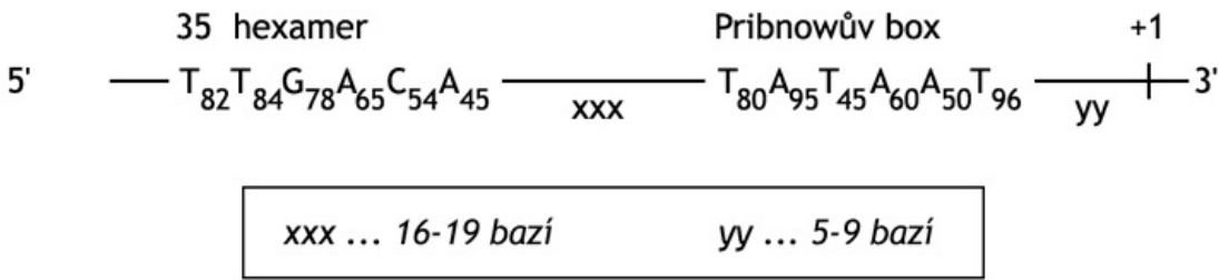
Schéma bakteriálního promotoru (kódující řetězec DNA)

No higher resolution available. Bakteriální_promotor.png (800 × 312 pixels, file size: 16 KB, MIME type: image/png)