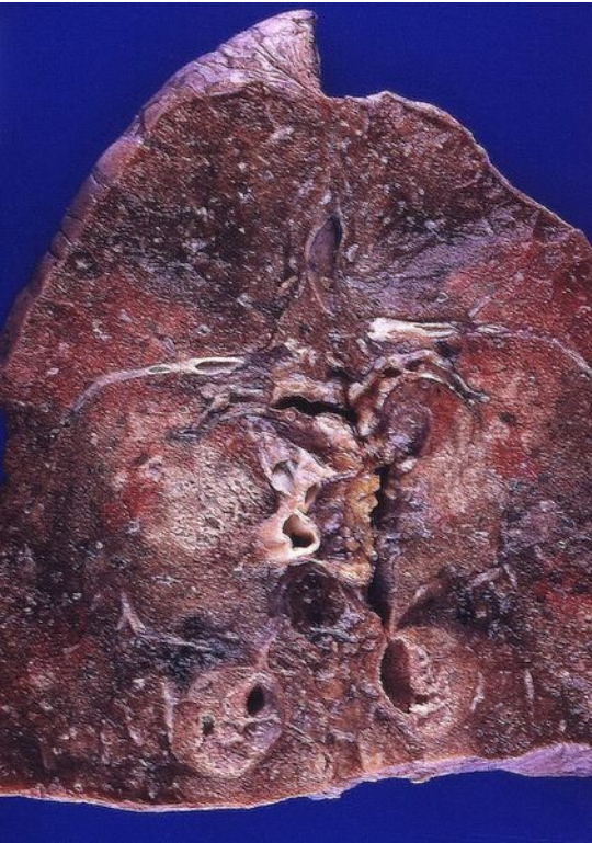
Size of this preview: 422 × 599 pixels.

Original file (451 × 640 pixels, file size: 316 KB, MIME type: image/jpeg)