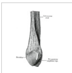
Distal part of the fibula