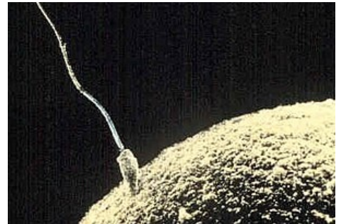
A sperm cell fertilizing an egg cell

The oocyte responds to these reactions with the zonal reaction (protection against polyspermy), the resumption of the second meiotic division (it completes it as soon as the sperm enters and forms the female pronucleus) and the metabolic activation of the egg (the activating factor arrives with the sperm). Mitochondria, which the sperm will bring to the egg during fertilization, are actively eliminated.