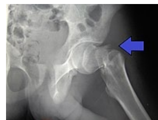
Dislocated fracture of the neck of the L femur