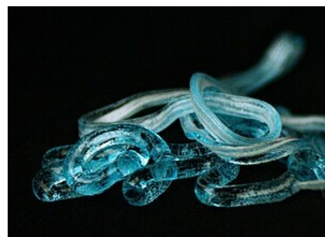
An example of a gel-forming colloid