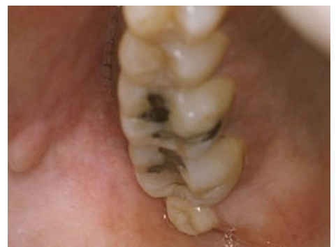
Microdontic tooth 18