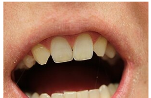
Hypodontia; second upper incisors missing