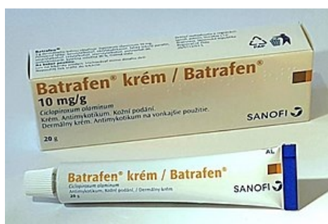
Batrafen® cream, a mass-produced medicinal product with ciclopirox

Ciclopirox is a broad-spectrum antifungal with good penetration into tissues (especially the nail plate), which also acts on spores. Used for the topical treatment of cutaneous mycoses and fungal vulvovaginitis.