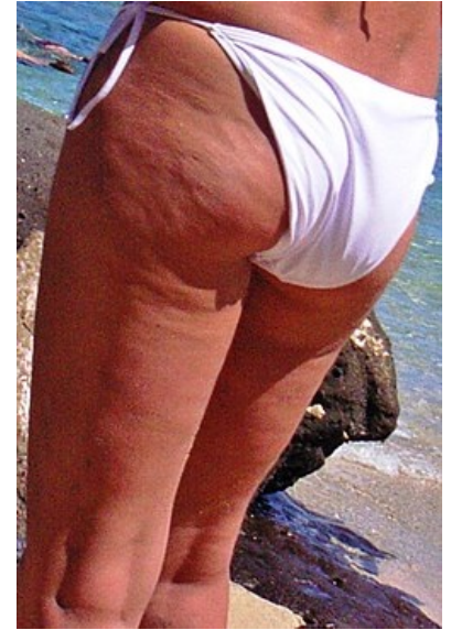
Cellulite on buttocks and thighs