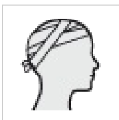
Traumatologie.png 50 × 50; 4 KB