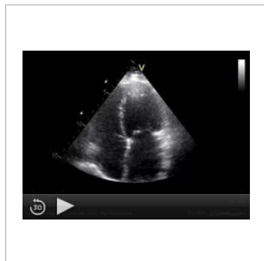
Restrictive cardiomyopathy with dilatation of both atria (4CH projection)