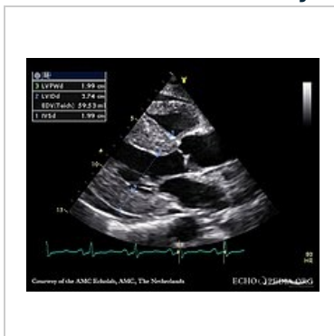
Cardiac amyloidosis with left ventricular wall hypertrophy and increased myocardial echogenicity (parasternal long axis projection)