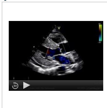
Cardiac amyloidosis with left ventricular wall hypertrophy and increased myocardial echogenicity (parasternal long axis projection)