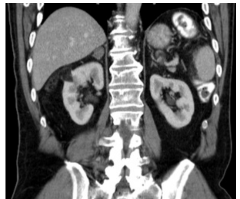
Angiomyolipoma of the right kidney - CT - hypodense deposit /fat tissue/