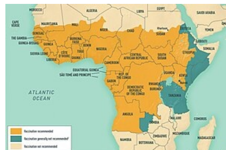
Occurrence of yellow fever in Africa in 2009