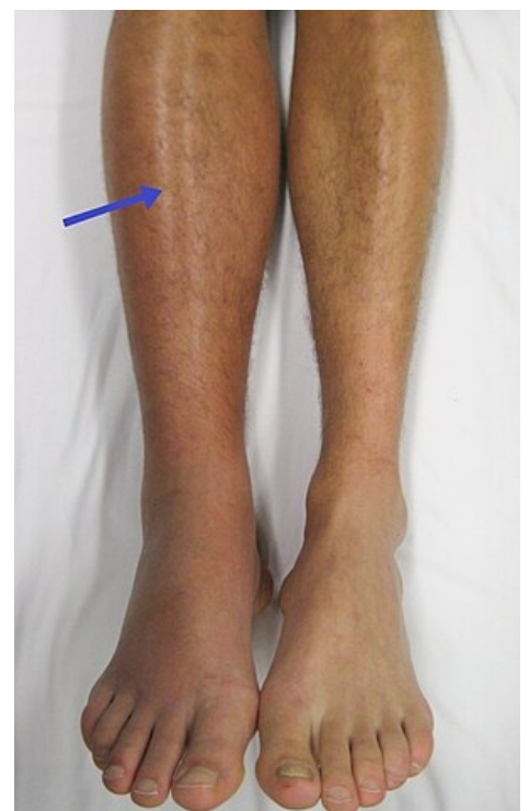
Lower limb edema.