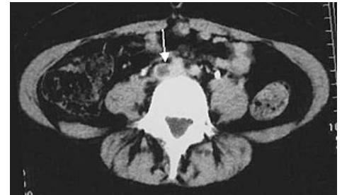
CT, thrombus of iliac right vein.