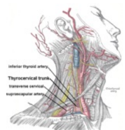
A. subclavian and some of its branches