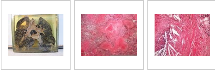
Miner's lung with tuberculosilicosis

The basis is a cluster of macrophages with SiO 2 particles in the cytoplasm, concentrically arranged collagen fibers are formed in the center, parts turn into acellular hyaline surrounded by a bulbous layered collagen capsule.