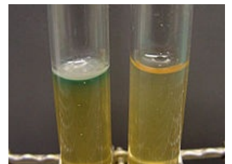
Pyocyanin production on soft agar. Right tube uninoculated, serving as a control.