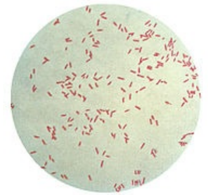
Pseudomonas aeruginosa gram staining