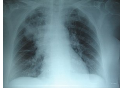
X-ray examination of a patient with pneumonia with inflammatory infiltrates visible.

There are no specific symptoms that would allow pneumonia to be diagnosed. The probability of diagnosis is increased by the presence of the above symptoms. We must take into account that younger children in particular are more likely to have non-specific symptoms such as lethargy, vomiting, and reluctance to eat or exercise. [4]