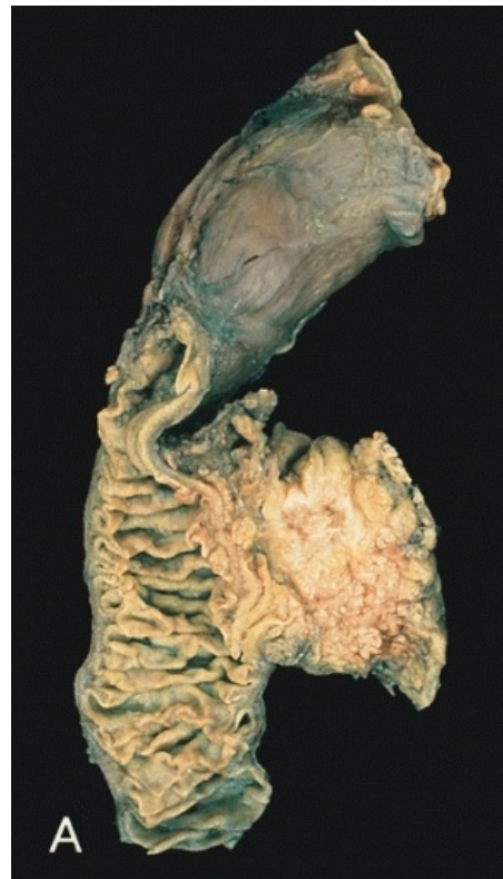
Small adenocarcinoma of the pancreatic head, after Whipple's resection