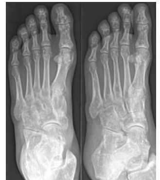
Osteopoikilie Fuss - 48jm - Roe 2Eb - 001