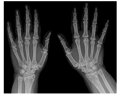
Osteopoikilosis of the skeleton of the hand.

DUNGL, Pavel, et al. Ortopedie . 1. edition. Praha : Grada Publishing, 2005. ISBN 80-247-0550-8.