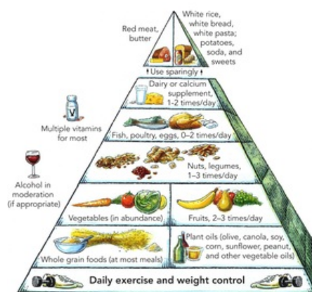
Food pyramid - Harvard food of Public Health