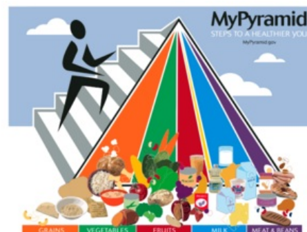
Food Pyramid - US Department of Agriculture