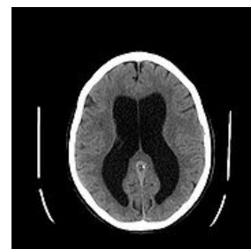
Enlarged brain ventricles

The causes of NPH can be very variable. The most common are trauma, hypertension, meningitis or some intracranial bleeding. However, there is still many patients with idiopathic form of NPH.