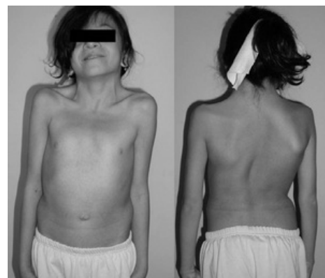
A picture of a girl with the typical features of NS

The protein product of PTPN11 is shp-2 and this, together with SOS1, positively transduces signals to Ras-GTP, a downstream effector. The KRAS mutations in NS appear to lead to K-ras proteins with impaired responsiveness to GTPase activating proteins .