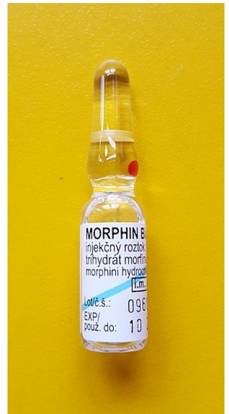
Morphine 1% vial