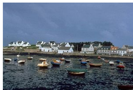
Znečištění vody ropou