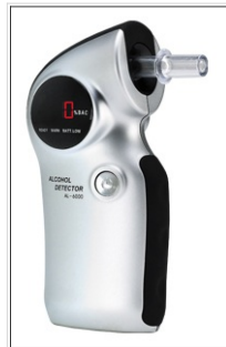
Breathalyzer [online]. [feeling. 2010-02-09]. < http://alkohol-tester.cz/ > foto z

Breathalyzers have undergone extensive development. Modern devices can be calibrated very precisely, their sensors have excellent stability over time, etc. They also control the volume of the sample taken for determination, so that the measurement takes place in the air exhaled from the lung alveoli (and not, for example, from the upper respiratory tract) and the results thus correspond to the concentration of alcohol in blood.