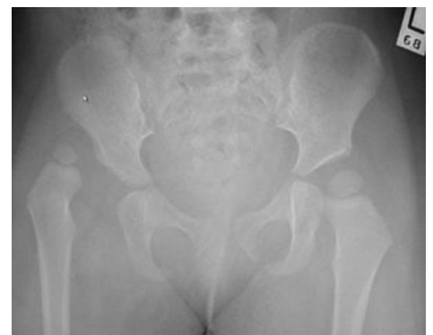
X-ray image of DDH.

3. degree - luxation - significant deformation of the acetabulum, significant anteversion, inversion of the limbus, stretched ligamentum teres and ligamentum transversum, changes on the