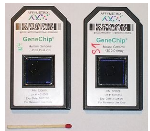
2 Affymetrix chips