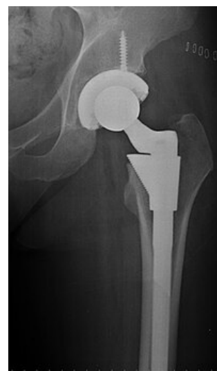
Total hip arthroplasty

Arthrodesis – Joint stiffening in the position of 15 ° flexion and 0-5 ° abduction and neutral rotation. It restores to the patient the possibility of hard physical work while standing, allows full load, but worsens life comfort while sitting.