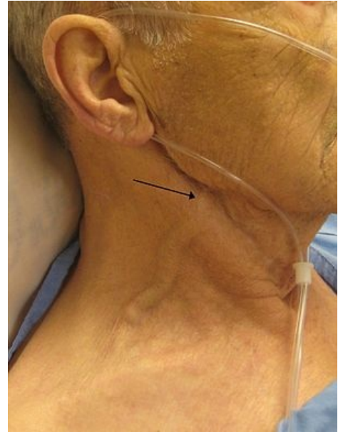
Congestion in jugular veins