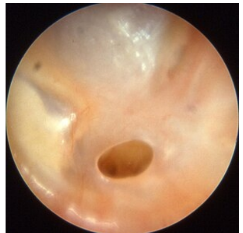
Otitis media chronica mesotympanalis