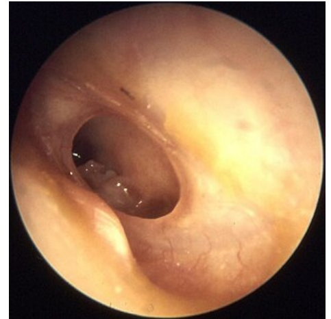
Otitis media chronica mesotympanalis