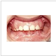
Scissor bite.jpg 493 × 297; 24 KB