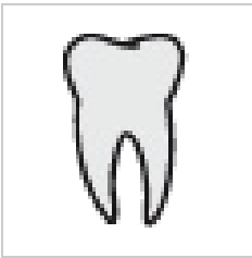
Tooth.png 50 × 50; 4 KB