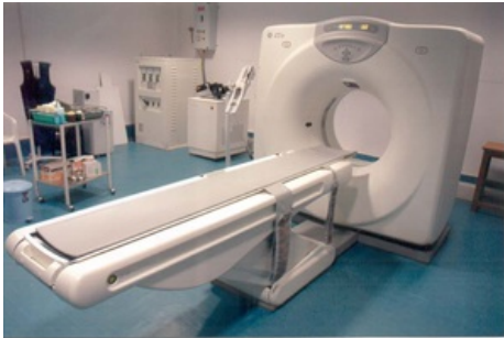
Figure 19 - medical CT scan.

This method simply uses a simple X-ray with detector on the other side but it is mounted on support that is able to rotate around the patient and produce many cross-sectional slices. These slices are next processed using mathematical modeling to produce a 3D image.