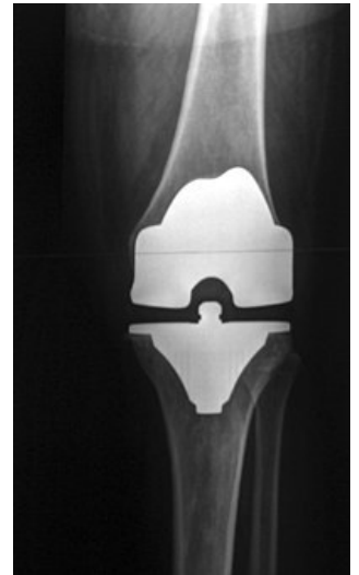
Total endoprosthesis of knee joint