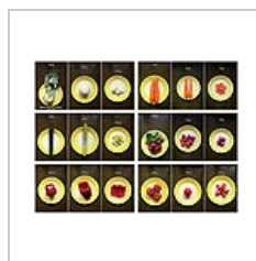
Zelenina.jpg 900 × 675; 308 KB