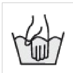
Hygiena.png 50 × 50; 4 KB

The following 4 files are in this category, out of 4 total.