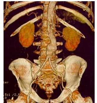
Abdominal aortic aneurysm in CT scan